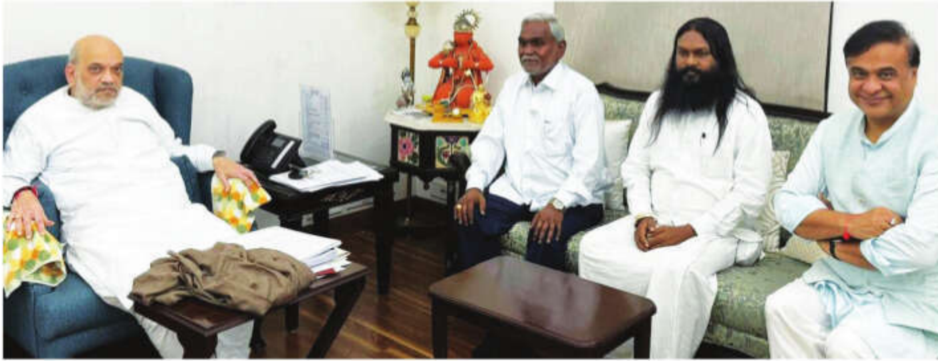
August in Ranchi," Sarma wrote in a social media post on 'X'.

Former Chief Minister of Jharkhand and a distinguished Adivasi leader of our country, @ChampaiSoren Ji met Hon'ble Union Home Minister @AmitShah Ji a short while ago. He will officially join the @BJP4India on 30th