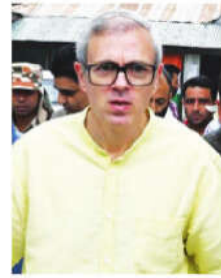
hints that he might reconsider his decision of not contesting the polls.

However, he took people by surprise when his name appeared in the list of 32 candidates released by the NC this morning. Omar in the past few days had dropped