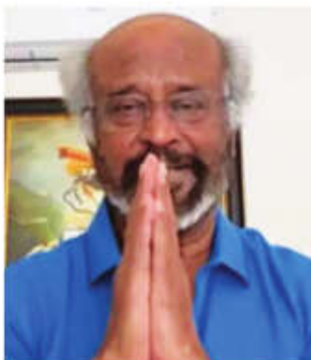
a recent party event here in Chennai organised by the DMK Engineer's Wing.

DMK Youth Wing secretary and Sports Minister Udhayanidhi Stalin made an appeal to the old warhorses in the party to make way for youngsters, bringing the tussle to the fore. "The youth are ready to join the DMK in large numbers and prepared to occupy responsible positions. We have to hold them by hand, guide them and make way for them. This is my appeal," he said addressing