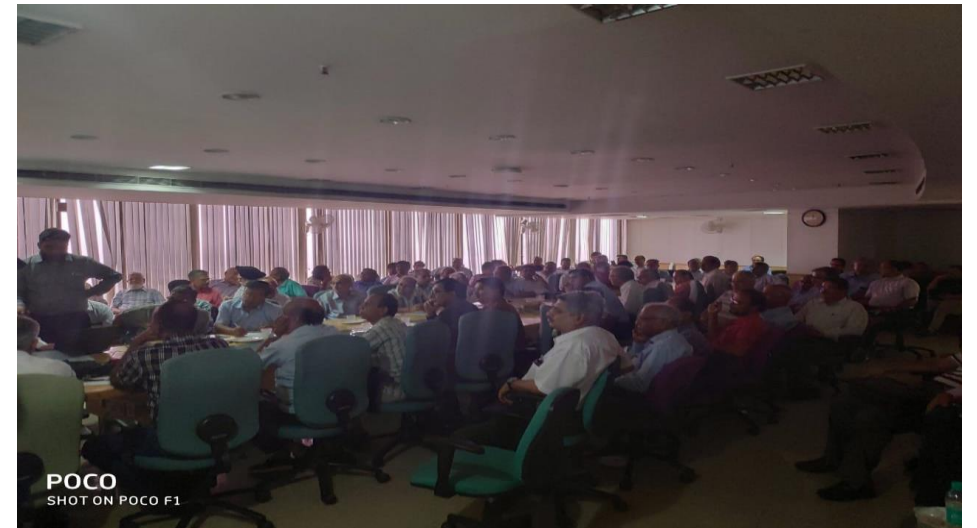
Awareness program at SAIL Scope Complex, Delhi