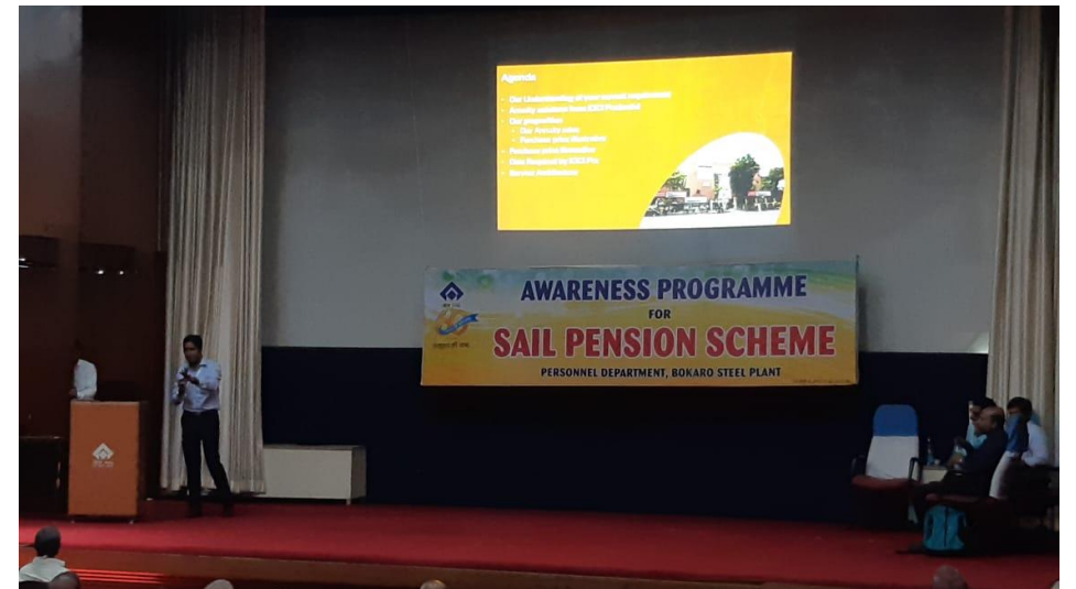
Awareness program at Bokaro Steel Plant