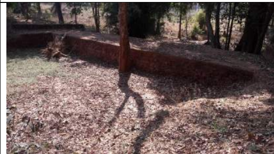
Puswada check dam No.3