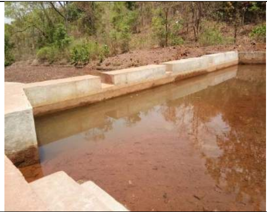
Mahamaya Temple Check dam