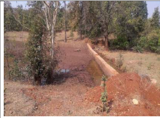
Kopedera Check dam No. 5