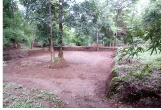
Puswada check dam No.2