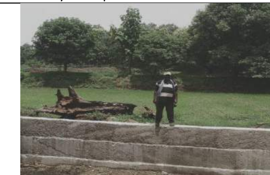
Kopedera-Check dam No.6