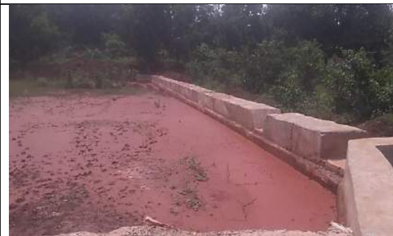
Mahamaya Temple- No.3