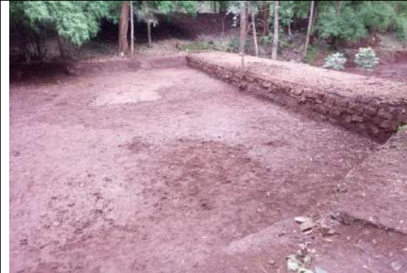
Puswada check dam No.1