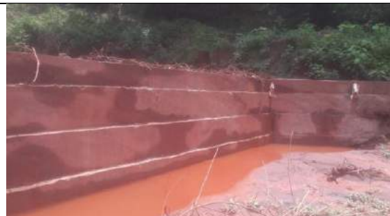
Mahamaya Temple- No.2